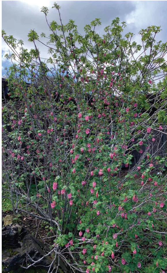
Below right: Beneath the sign, a Ceanothus maritimus in bloom and in the background, a tall Arctostaphylos (manzanita)—the only native plant that was already there when the garden was planted in 2008. March 2023